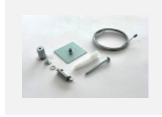
145-50302, N wire suspension 6000mm - 1 pc + metal handle