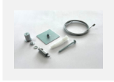
145-50300, N wire suspension 2000mm - 1 pc + metal handle