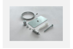
145-50303, N wire suspension for joint 2000mm - 1 pc + metal handle