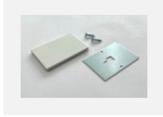
145-50102, W 2 x end cap - metal, screwless