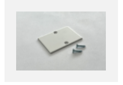
145-50101, W 2 x end cap - metal, screw