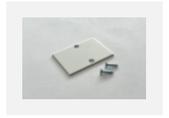
145-50101, B 2 x end cap - metal, screw