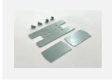
145-50200, F direct connector with caps of clearance