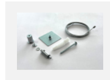
145-50300, N wire suspension 2000mm - 1 pc + metal handle