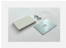
145-50102, B 2 x end cap - metal, screwless