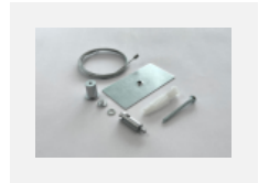
145-50303, N wire suspension for joint 2000mm - 1 pc + metal handle