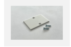
145-50101, B 2 x end cap - metal, screw