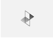
145-20700, S 2 pcs of wall fastening Lina45