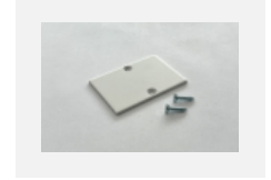
145-50101, B 2 x end cap - metal, screw