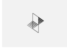
145-20700, S 2 pcs of wall fastening Lina45