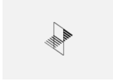
145-20700, B 2 pcs of wall fastening Lina45