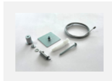
145-50300, N wire suspension 2000mm - 1 pc + metal handle