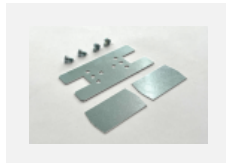
145-50200, F direct connector with caps of clearance