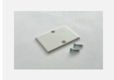
145-50101, S 2 x end cap - metal, screw