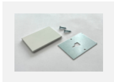
145-50102, W 2 x end cap - metal, screwless