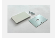
145-50102, B 2 x end cap - metal, screwless