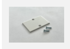
145-50101, W 2 x end cap - metal, screw