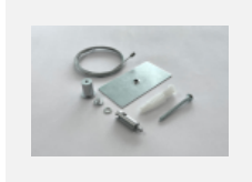
145-50305, N wire suspension for joint 6000mm - 1 pc + metal handle