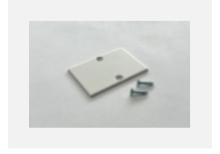
145-50101, S 2 x end cap - metal, screw