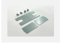
145-50200, F direct connector with caps of clearance