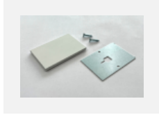
145-50102, S 2 x end cap - metal, screwless