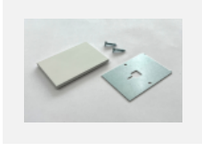
145-50102, S 2 x end cap - metal, screwless