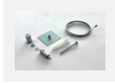
145-50301, N wire suspension 4000mm - 1 pc + metal handle