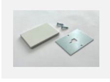
145-50102, W 2 x end cap - metal, screwless