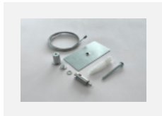
145-50304, N wire suspension for joint 4000mm - 1 pc + metal handle