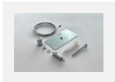
145-50305, N wire suspension for joint 6000mm - 1 pc + metal handle