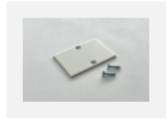
145-50101, W 2 x end cap - metal, screw