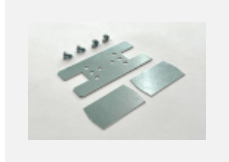
145-50200, F direct connector with caps of clearance