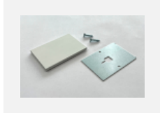
145-50102, W 2 x end cap - metal, screwless