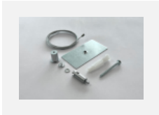
145-50304, N wire suspension for joint 4000mm - 1 pc + metal handle