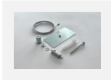
145-50305, N wire suspension for joint 6000mm - 1 pc + metal handle