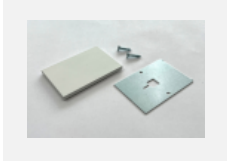
145-50102, W 2 x end cap - metal, screwless