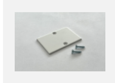
145-50101, W 2 x end cap - metal, screw