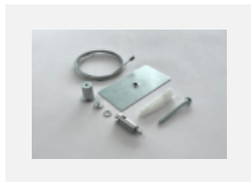
145-50304, N wire suspension for joint 4000mm - 1 pc + metal handle