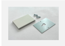
145-50102, W 2 x end cap - metal, screwless