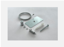
145-50304, N wire suspension for joint 4000mm - 1 pc + metal handle