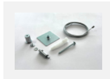
145-50301, N wire suspension 4000mm - 1 pc + metal handle