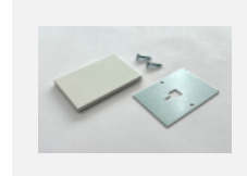
145-50102, B 2 x end cap - metal, screwless