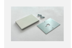
145-50102, S 2 x end cap - metal, screwless