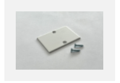
145-50101, B 2 x end cap - metal, screw