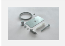
145-50305, N wire suspension for joint 6000mm - 1 pc + metal handle