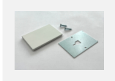
145-50102, B 2 x end cap - metal, screwless