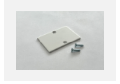
145-50101, W 2 x end cap - metal, screw