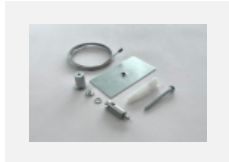
145-50304, N wire suspension for joint 4000mm - 1 pc + metal handle