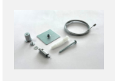
145-50300, N wire suspension 2000mm - 1 pc + metal handle