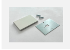
145-50102, W 2 x end cap - metal, screwless