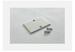
145-50101, W 2 x end cap - metal, screw