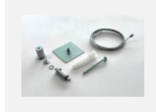
145-50302, N wire suspension 6000mm - 1 pc + metal handle