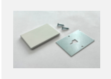
145-50102, W 2 x end cap - metal, screwless