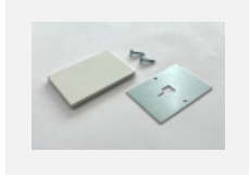
145-50102, S 2 x end cap - metal, screwless