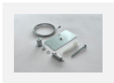
145-50305, N wire suspension for joint 6000mm - 1 pc + metal handle