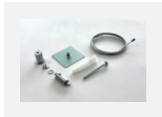
145-50300, N wire suspension 2000mm - 1 pc + metal handle