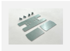
145-50200, F direct connector with caps of clearance