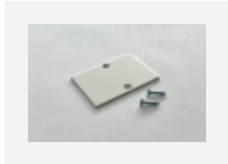
145-50101, S 2 x end cap - metal, screw