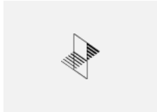
145-01200, F Accessory for gear-tray release for Lina145