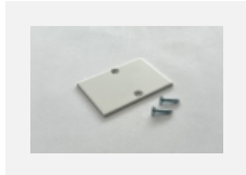
145-50101, B 2 x end cap - metal, screw