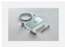
145-50304, N wire suspension for joint 4000mm - 1 pc + metal handle