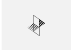
145-01200, F Accessory for gear-tray release for Lina145