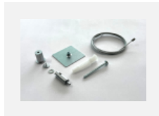
145-50301, N wire suspension 4000mm - 1 pc + metal handle