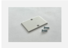
145-50101, S 2 x end cap - metal, screw