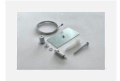
145-50303, N wire suspension for joint 2000mm - 1 pc + metal handle