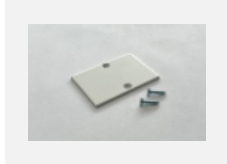
145-50101, B 2 x end cap - metal, screw