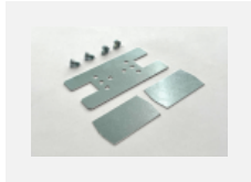
145-50200, F direct connector with caps of clearance