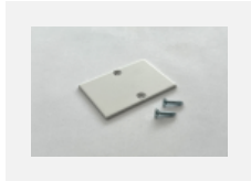
145-50101, B 2 x end cap - metal, screw