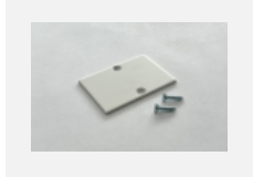
145-50101, B 2 x end cap - metal, screw