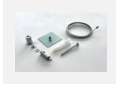
145-50301, N wire suspension 4000mm - 1 pc + metal handle