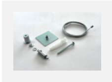
145-50300, N wire suspension 2000mm - 1 pc + metal handle