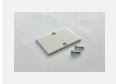
145-50101, S 2 x end cap - metal, screw