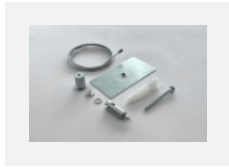
145-50304, N wire suspension for joint 4000mm - 1 pc + metal handle