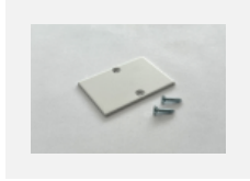
145-50101, S 2 x end cap - metal, screw