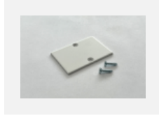
145-50101, W 2 x end cap - metal, screw