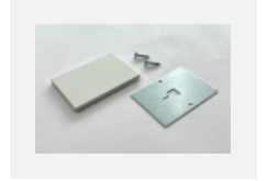
145-50102, S 2 x end cap - metal, screwless