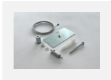
145-50305, N wire suspension for joint 6000mm - 1 pc + metal handle