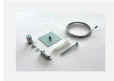
145-50302, N wire suspension 6000mm - 1 pc + metal handle