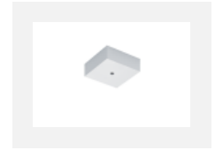
00-00370, W ceiling cup 80x80x32mm