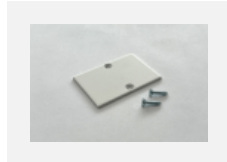
145-50101, S 2 x end cap - metal, screw