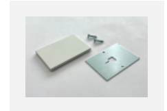
145-50102, S 2 x end cap - metal, screwless