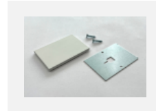
145-50102, B 2 x end cap - metal, screwless