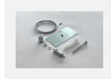
145-50303, N wire suspension for joint 2000mm - 1 pc + metal handle