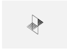
145-20700, W 2 pcs of wall fastening Lina45