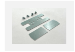
145-50200, F direct connector with caps of clearance