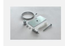
145-50304, N wire suspension for joint 4000mm - 1 pc + metal handle