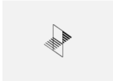
145-20700, B 2 pcs of wall fastening Lina45