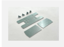
145-50200, F direct connector with caps of clearance