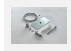
145-50304, N wire suspension for joint 4000mm - 1 pc + metal handle