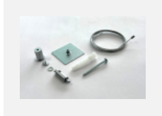
145-50301, N wire suspension 4000mm - 1 pc + metal handle