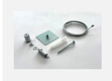
145-50301, N wire suspension 4000mm - 1 pc + metal handle