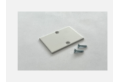
145-50101, W 2 x end cap - metal, screw