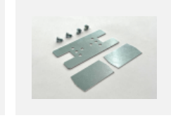
145-50200, F direct connector with caps of clearance