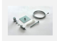
145-50302, N wire suspension 6000mm - 1 pc + metal handle