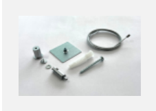
145-50300, N wire suspension 2000mm - 1 pc + metal handle