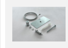
145-50304, N wire suspension for joint 4000mm - 1 pc + metal handle